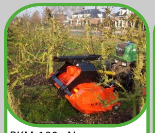
BKM-180 - New Cutting width 180 cm (5'11") Universal Min. 45 HP Price: $13,000 ($1,200 savings)