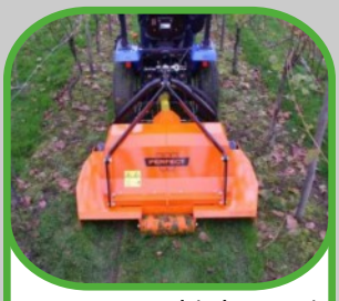
VT-280 - Used (Like New) Cutting width 7'8" - 9'2" Min. 45 HP Price: $12,000