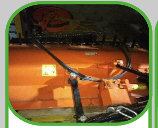
KL-150 + Solo Swing -Demo Cutting width 150 cm (4'11") Min. 45 HP Price: $9,500 ($2,500 savings)