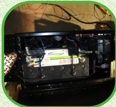
2 High quality 12V batteries