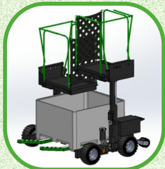
CAD designed, engineer approved