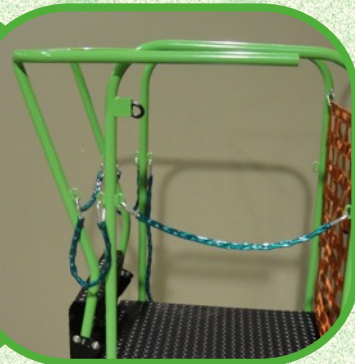
Angle of platform safety bars can be changed with a simple foot switch for further reach/comfort