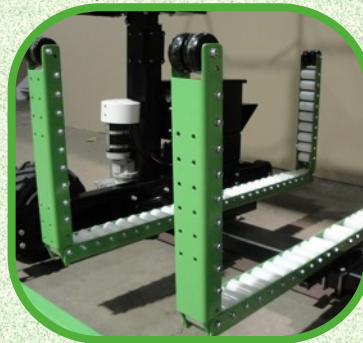
Spring loaded bin carrier - easy on, easy off.