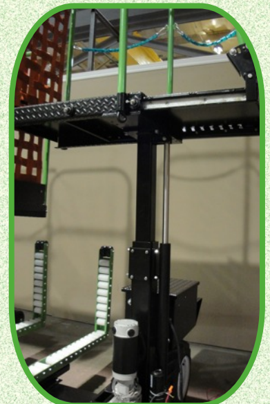
Balconies with individual height adjustment