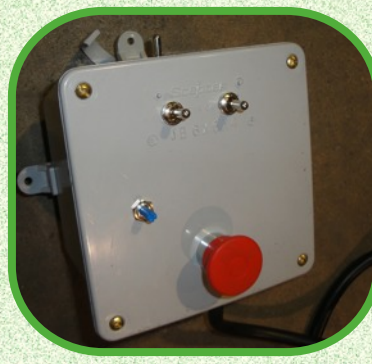
Simple control panel with speed control